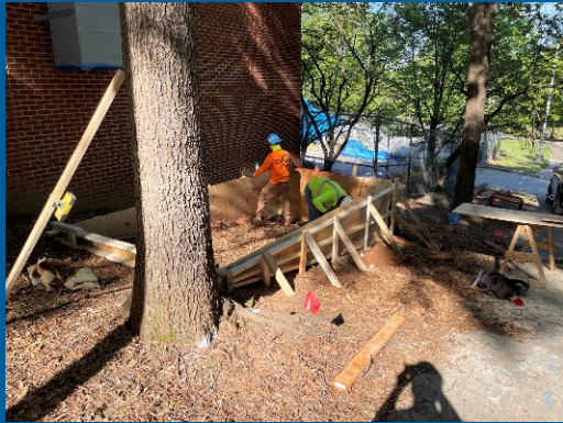
HVAC unit pad being formed for concrete Pour