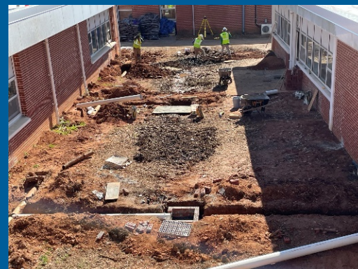
West Courtyard Drainage Pipe Replacement