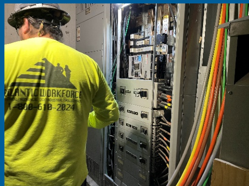
New 600AMP Breaker Installed