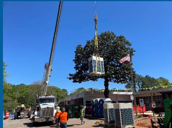
Crane Mobilized for Rooftop HVAC Units