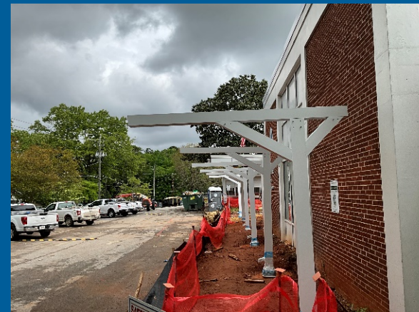
Canopy Columns Erected