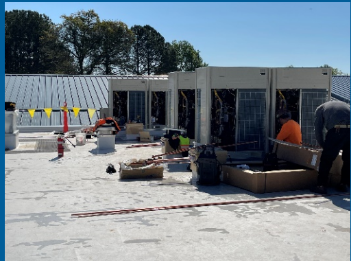
Rooftop HVAC units landed on roof